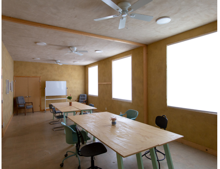
Alta Conference Room